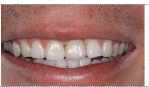
Fig. 10-A. final crown with functional outcome